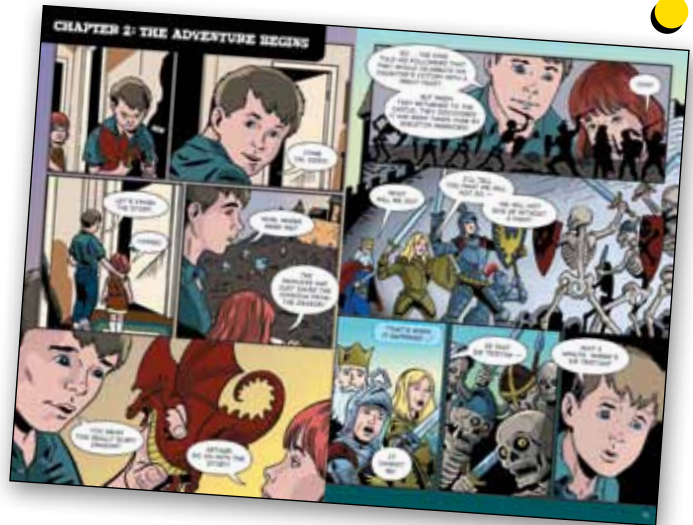
Pages from Arthur's Knights