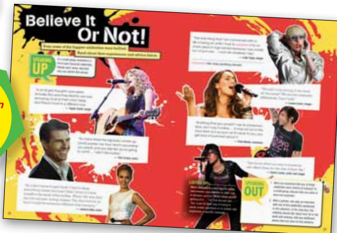
Pages from No Bullies Allowed!