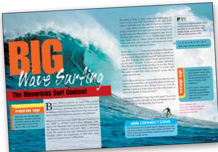
Pages from Stomp It!