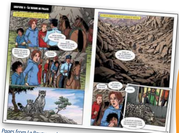
Pages from Le Royaume du Léopard Des Neige